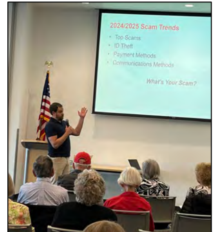
A representative from AARP explains the latest scams to watch out for.